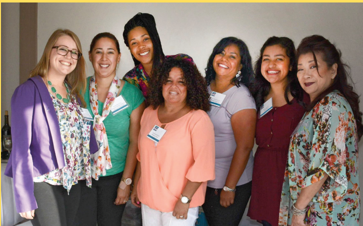
Building Futures' smiling staff

At our Housing Resource Center, we provided 257 people with services designed to quickly re-house them after they became homeless, or help them avert homelessness. At Bessie Coleman Court, 52 households were provided with a place to call home, as well case management and community gatherings for residents. (See page one article on volunteer-led improvements that made “BCC” a great place to call home.)